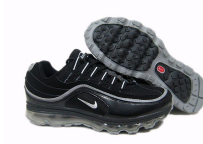
air jordan shoes spizike black grey red ID:5448 Free Shipping